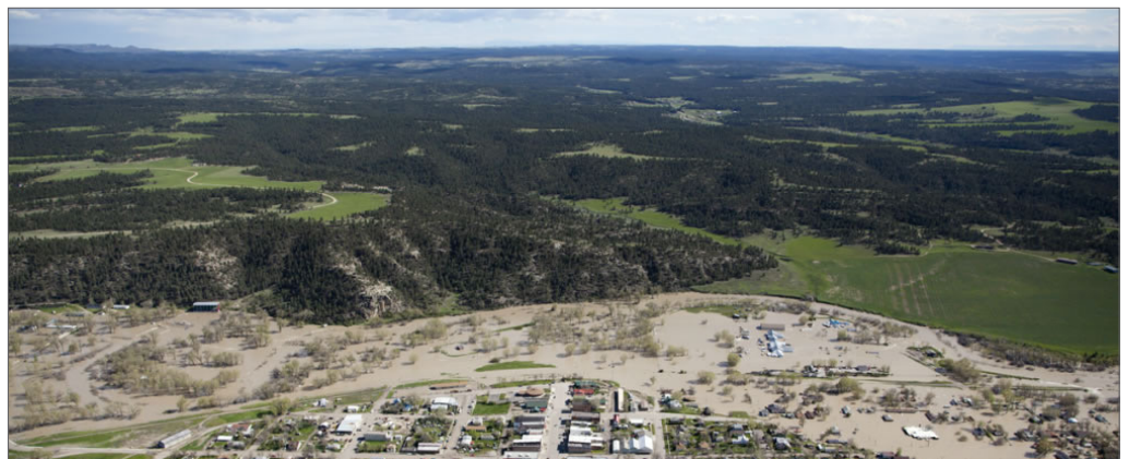
2011 Musselshell Flooding.