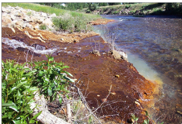
AMD – Acid Mine Drainage at Belt Creek

The 2011 field trip is scheduled for Wednesday, October 5 and begins with a stop at Belt Creek near the town of Belt to discuss acid mine drainage remediation and prevention. The remainder of the trip will take us on a journey from the recharge area of the Madison Aquifer at Sluice Boxes State Park to the discharge area at Giant Springs along the Missouri River. In Belt, we will set up at a site where acidic drainage from the Anaconda underground coal mine discharges to