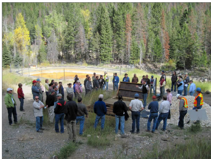
The field trip also stressed Ten Mile Creek mitigation efforts.