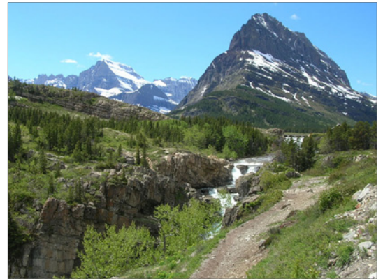
Swift Current Creek, Glacier National Park.

MT AWRA V.P. Dave Donohue is in charge of this year's banquet photo contest. Dave is now accepting your latest and greatest water resources photos. Any and all photos related to Montana's water resources and water resource professionals and students will be considered. These can be scenic, technical, catastrophic, recreational or humorous! There will be prizes for the top photos. Send photos to Dave Donohue by September 15, or call (406) 443-6169 (x203). All photos will automatically be considered for the 2012 Montana Water Center Calendar unless participants opted out by contacting Steve Guettermann ( stephen.guettermann@montana.edu ).