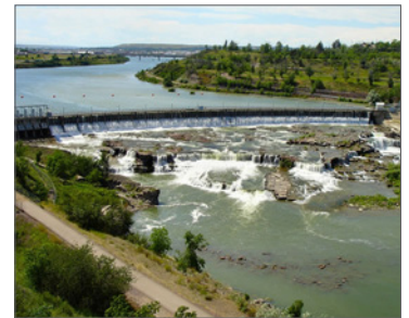
Black Eagle Dam Great Falls, Montana

Registration will open again at 7:30 am Thursday. The conference will kick-off at 8:15 with opening announcements from MT AWRA officers and the Water Center. This will be followed by an address from