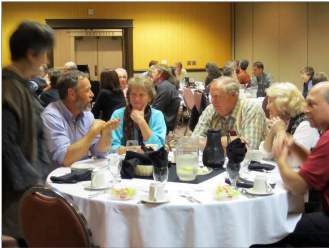
Banquet goes anxiously await the evening's entertainment!

The early part of the afternoon was broken into two concurrent technical sessions, one on Stream Restoration and Assessment and one relating to Groundwater issues. After a short break, folks chose from talks relating to either Aquatic Ecosystems or Water Policy and Use.