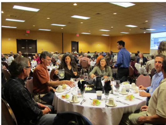
Folks at the 2010 banquet.