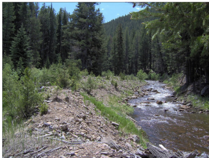
Preconference field trip to the Upper Ten Mile Creek Superfund site.